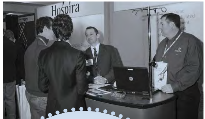
Exhibit Hall Raffles

Stand out from the crowd by sponsoring a raffle item. All raffle sponsors will receive additional recognition (i.e., Program Journal).